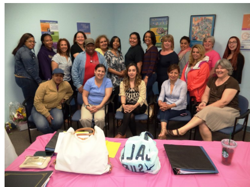
2013-2014 In-person Infant Toddler CDA Class Graduates