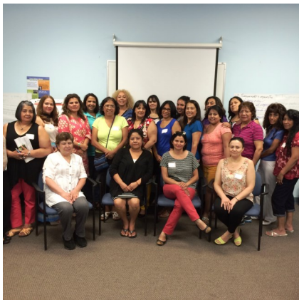
Spanish Business Series Participants